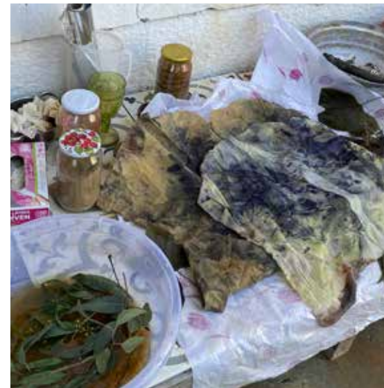
Work in progress | From flat pattern to nature prints