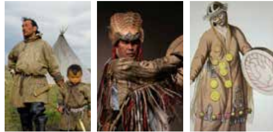
Crimea tartars and shamans