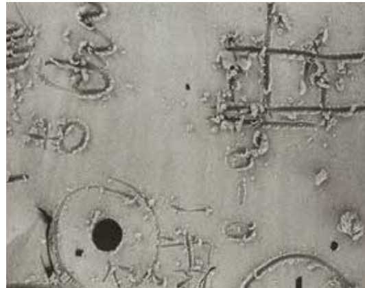
J. Beuys, “Sandzeichnungen”, chromogenic print, 1980