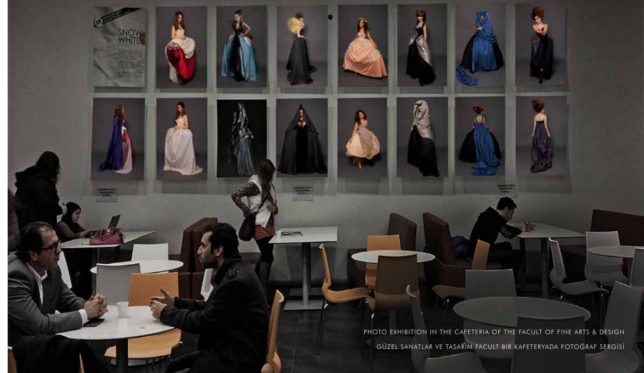
PHOTO EXHIBITION IN THE CAFETERIA OF THE FACULTY OF FINE ARTS & DESIGN