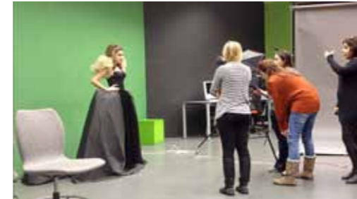
PROFESSIONAL GREEN SCREEN FILMING TAINED.

AS ONE OF THE THREE DEPARTMENTS WITHIN THE FACULTY OF COMMUNICATION THE DEPARTMENT OF MEDIA AND COMMUNICATION IS OFFERING AN EDUCATION AIMING TO TRAIN MEDIA PROFESSIONALS FOR THE FUTURE. THE BALANCE BETWEEN THE THEORETICAL AND THE PRACTICAL SIDE OF THE MEDIA PROFESSION IS DELICATELY MAINTAINED.