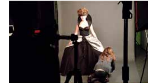
COSTUME ARRANGEMENT FOR PHOTOGRAPHY

DEPT. OF FASHION & TEXTILE DESIGN COSTUME DESIGN COURSE