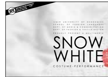
Snow White Press Kit