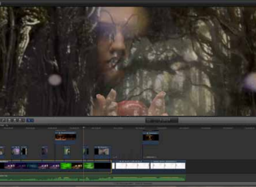
The digital final cut project

Medya ve iletişim öğrencilerinin kısa dizileri entegre olmak için filme edilmiştir sahne için arka plan video.