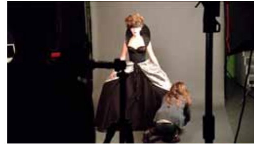
COSTUME ARRANGEMENT FOR PHOTOGRAPHY

DEPT. OF FASHION & TEXTILE DESIGN COSTUME DESIGN COURSE