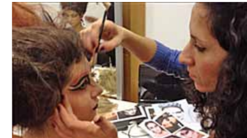
THEATRE MAKE-UP FOR ALL PERFORMERS

WORKSHOPS INTEGRATE A VARIETY OF DRAMA AND LANGUAGE-FOCUSED ACTIVITIES SUPPLEMENTED BY PHYSICAL AND VOICE EXERCISES PLUS CONFIDENCE AND TEAM BUILDING ACTIVITIES INCREASING THE STUDENTS CONFIDENCE IN USING THEIR ENGLISH.