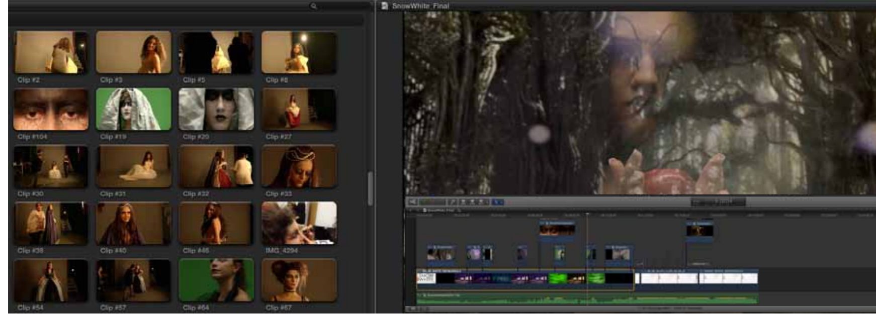
The digital final cut project

The students of media and communication have been filming short sequences to be integrated in the background video for the stage.