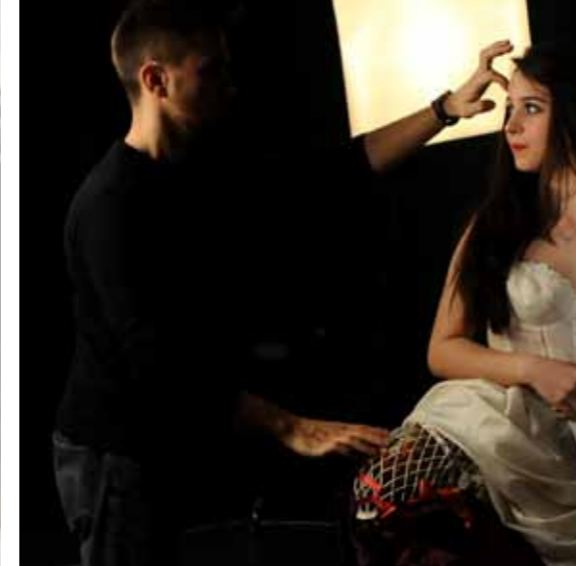
Fittings, Make-Up and Preparations of the Photo Shooting photographed by Özge Deniz. Fittings, Make-Up and Preparations of the Photo Shooting photographed by Özge Deniz.