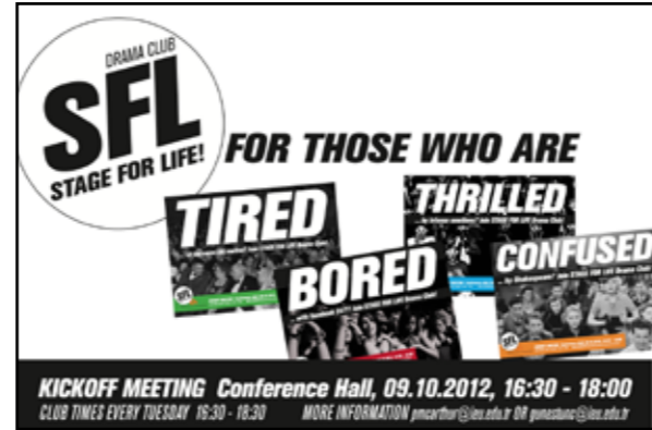
SFL in action