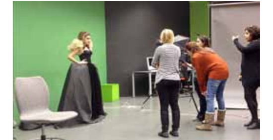
PROFESSIONAL GREEN SCREEN FILMING TAINED.

AS ONE OF THE THREE DEPARTMENTS WITHIN THE FACULTY OF COMMUNICATION THE DEPARTMENT OF MEDIA AND COMMUNICATION IS OFFERING AN EDUCATION AIMING TO TRAIN MEDIA PROFESSIONALS FOR THE FUTURE. THE BALANCE BETWEEN THE THEORETICAL AND THE PRACTICAL SIDE OF THE MEDIA PROFESSION IS DELICATELY MAINTAINED.