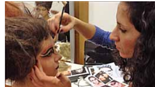
THEATRE MAKE-UP FOR ALL PERFORMERS

WORKSHOPS INTEGRATE A VARIETY OF DRAMA AND LANGUAGE-FOCUSED ACTIVITIES SUPPLEMENTED BY PHYSICAL AND VOICE EXERCISES PLUS CONFIDENCE AND TEAM BUILDING ACTIVITIES INCREASING THE STUDENTS CONFIDENCE IN USING THEIR ENGLISH.